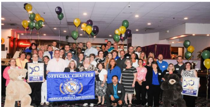
2016 First Place Winner: Greater Cincinnati and Northern Kentucky Chapter